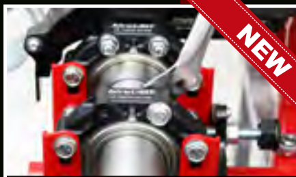
SUPPORT AXLE BEARING