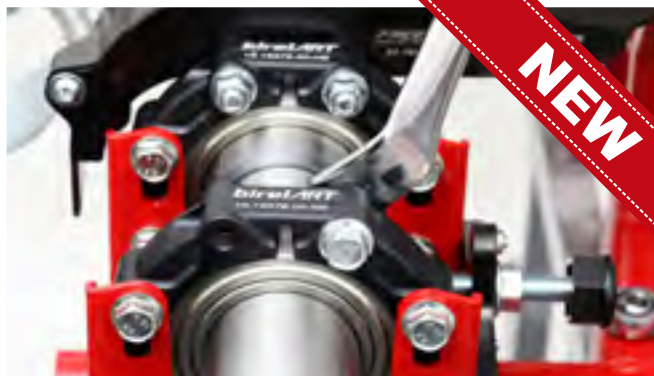
SUPPORT AXLE BEARING